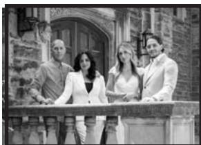
The Vescio Family