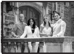
The Vescio Family