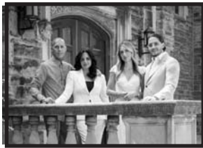
The Vescio Family