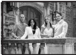
The Vescio Family