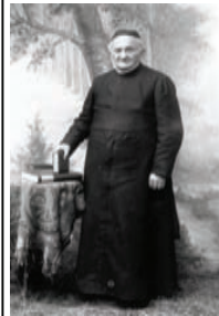
ST. ARNOLD JANSSEN, SVD 15 - St. Arnold Janssen, SVD Founder, Society of the Divine Word (SVD)

My Lord of all newness, I do say "Yes" to You and to the calling that You have given to me. I accept the new life of grace that You have prepared for me and I willingly accept Your gracious invitation. Help me, dear Lord, to daily answer the glorious vocation to the life of grace I have been given. Jesus, I trust in You.