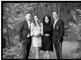
The Vescio Family