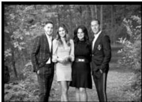
The Vescio Family