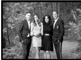
The Vescio Family