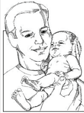
Die de Pai

O Evangelho confronta-nos com a pergunta de Jesus: "e vós, quem dizeis que Eu sou?" Paralelamente, apresenta o caminho messiânico de Jesus, não como um caminho de glória e de triunfos humanos, mas como um caminho de amor e de cruz. "Conhecer Jesus" é aderir a Ele e segui-l'O nesse caminho de entrega, de doação, de amor total.