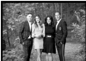
The Vescio Family