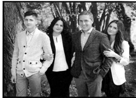
Vescio Family Serving Your Family

Woodbridge Chapel 8101 Weston Road 905-850-3332 Toronto Chapel 2080 Dufferin Street 416-656-3332 (New) Maple Chapel 211 McNaughton Road East 905-303-0770